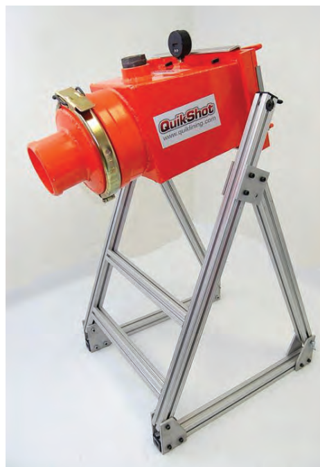
Quik-Shot from PrimeLine Products

One system using epoxy is the Stinger mini steam unit from Perma-Liner Industries , which is a compact steam cure system for 2- to 6-inch-diameter pipes. The unit uses bladder inversion heads so users never lose pressure. Features include rapid cure times, infinite working time while still using 100 percent solids epoxy, no rush or downtime, and an average 45-minute cure time on a 60-foot lateral.