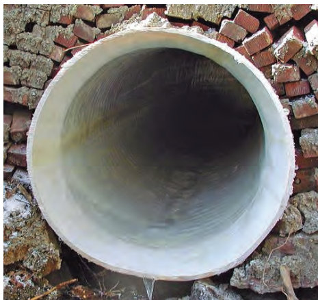
CIPP from Inliner Technologies

Lanzo has done trenchless repair on more than 10 million linear feet of pipelines in diameters as large as 120 inches throughout North America. Some of their most notable projects include lining an 18- to 15-inch transition sewer 20 feet below the Greektown Casino and restaurant in Detroit, and