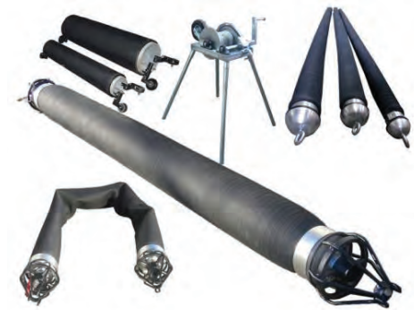
CIPP sectional lining bladders from Logiball

There are several CIPP technologies available, including CIPP from Inliner Technologies , which combines a non-woven engineered tube or liner with a wide array of thermosetting resins determined by the pipeline problem and surrounding environment. The technology can span 4- to 120-inch-diameter pipe; renew pipes with bends, diameter changes or non-circular geometries; and be used in gravity and pressure applications.