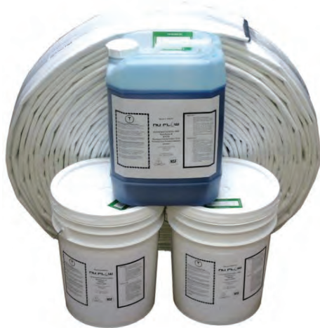
Nu Drain system from Nu Flow Technologies

as the inconvenience associated with open cut replacement of distribution water mains have caused prioritization of NSF 61 certified rehabilitation methods including sequential carbon fiber/epoxy matrix installation, as well as potable water CIPP,” Tingberg says.