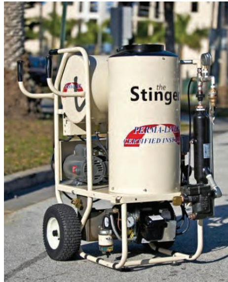
Stinger mini steam unit from Perma-Liner Industries

“Reduced or simply no implementation of solvents such as Styrene is being considered by municipalities at a growing rate,” Tingberg says. “The typical European installation of CIPP today is either UV cured or remote epoxy, either of which would be considered green CIPP by my thinking.”