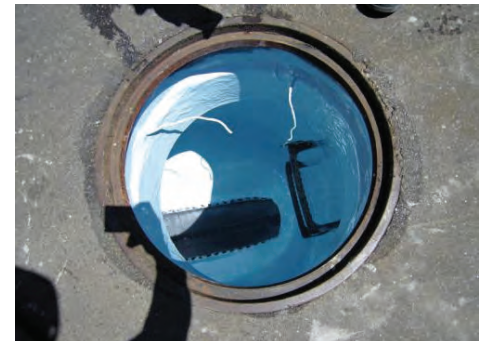
Raven 405FS (fast set) from Raven Lining Systems

Tingberg sees many things coming up for the future of the industry, including the changing chemical characteristics of the sanitary systems. “They’ll become more demanding as the chemicals become more concentrated, requiring better resins and more corrosion-resistant materials.”